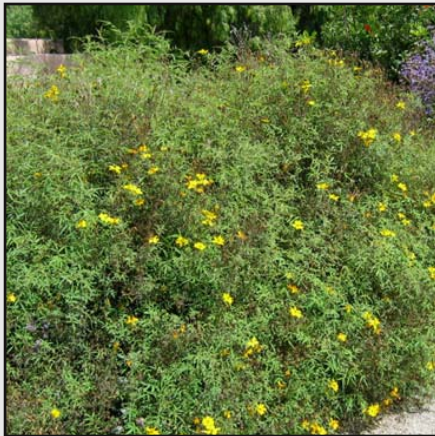
Bush Marigold Tagetes lemmonii

Upright, perennial shrub with yellow flowers.