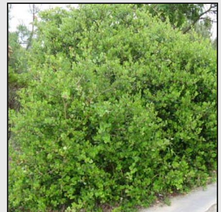
Lemonade Berry Rhus integrifolia

Evergreen shrub up to 8ft. tall, pinkish flowers, edible berries can be used in lemonade.