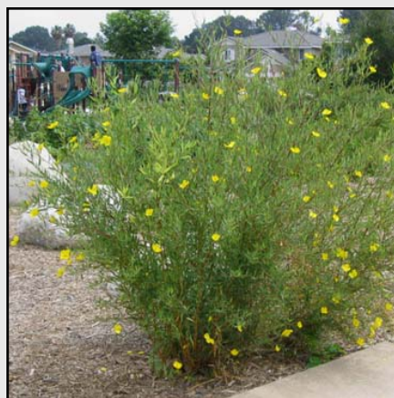
Bush Poppy or Island Bush Poppy Dendromecon rigida / D. harfordii

Upright shrub with large yellow flowers and slender stems, can grow up to 10ft. tall.