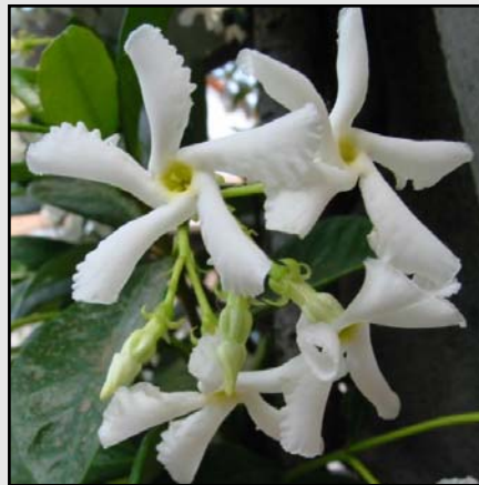
Ivory star jasmine Trachelospermum spp.

Evergreen, vining groundcover up to 20' across. It has glossy, dark green leaves and pale yellow, pinwheel-shaped flowers with a jasmine scent.