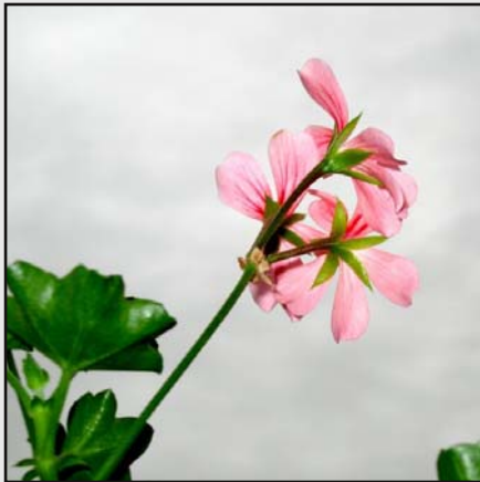
Ivy geranium Pelargonium peltatum

Glossy, bright green leaves with flowers in white, pink, rose, red, and lavender. Vigorous groundcover recommended for flat areas only, not suitable for erosion control.