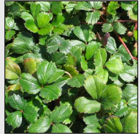
Beach strawberry Fragaria chiloensis

Forms lush compact mat 4"-6" high. Glossy dark green leaves, white flowers. Mow or cut back annually to force new growth.